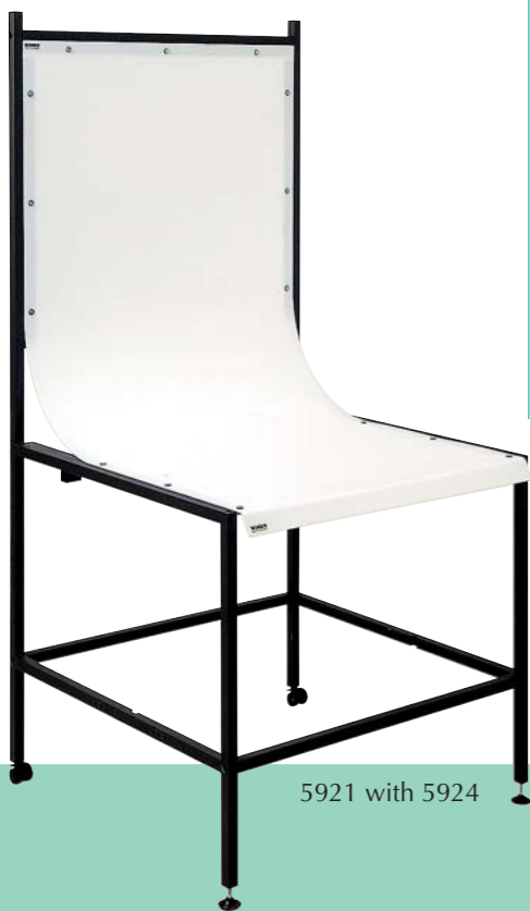
5921 with 5924

A special feature of the Kaiser TopTable systems is the add-on table equipped with clear acrylic glass 5922 ③. It is simply placed on the basic table. The clear acrylic sheet has the same concave shape as the diffused sheet underneath and runs parallel to it. Objects photographed on this set-up appear to float in mid-air against the background. It is often desired to separate the object from the background when shooting. The object can be outlined by backlighting it through the acrylic sheet. So the TopTable PRO has provisions to attach Kaiser lighting units beneath the acrylic plate. These lights can be found in Kaiser's line of copy lights. They are equipped with daylight fluorescent tubes and provide uniform lighting emitted from a large area. These lights can generally be used for lighting purposes with the table similar to the way that they are mounted to copy stands.